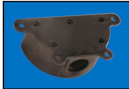
A-101 Weather proof cover