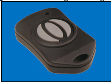
PK-01 Universal programming key PK-02 Keypad lock/unlock key