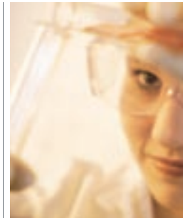
Healthcare, the sciences