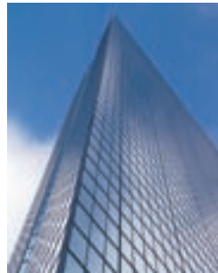
HVAC / Building management