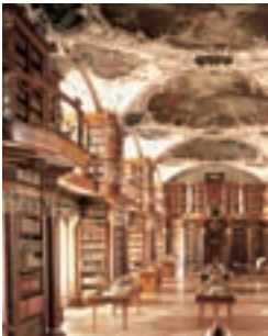
Museums, art galleries

The HygroPalm2-series (with integrated or interchangeable probes) is ideal for all applications where exact measurement of humidity and temperature is of decisive importance, e.g. the food and pharmaceutical industries, printing and paper industries, many trades, the sciences, meteorology, agricultural sector, climatology, etc. There is hardly a field today in which these parameters may be ignored. It is ultimately the measuring task at hand that defines the HygroPalm instrument that best meets your needs.